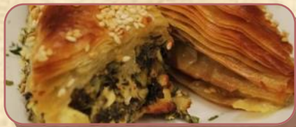
Spanakopita $4 per piece