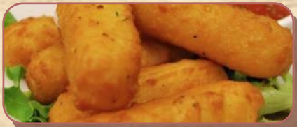
Mozzarella Sticks $1.25 per piece