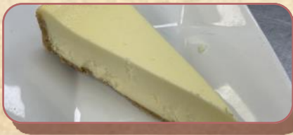
"NY Style" Cheesecake $4.95 per piece