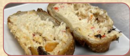
Asian Seafood Eggrolls $2.75 Each