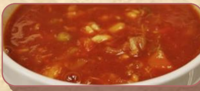
Maryland Crab Soup

$34.95 Small / $54.95 Large Penne pasta, tomatoes, cucumbers, onions, olives, pepperoncinis, roasted peppers, artichokes with either Creamy or Basil Pesto dressing