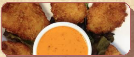
Panko Breaded Shrimp $1.50 per piece