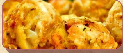
Crab Balls $6.00 per piece (2 oz)