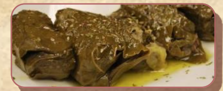
Dolmades $0.95 per piece