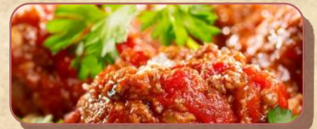
Meatballs (1/2 oz) Greek Style (mint & garlic) Italian Style (marinara) $0.75 per piece