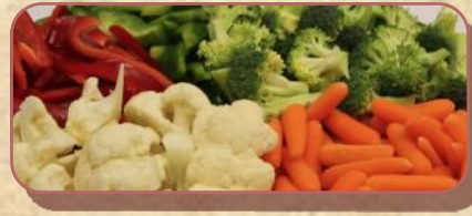
Veggie Platter $34.95 Small / $54.95 Large

Feta cheese, kalamata olives, roasted peppers & pepperoncini seasoned with oregano & olive oil.