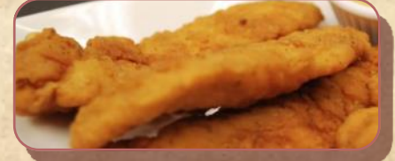
Chicken Tenders $2.25 per piece