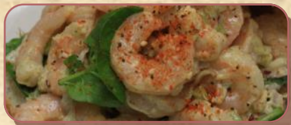
Shrimp Salad $39.95 per lb.