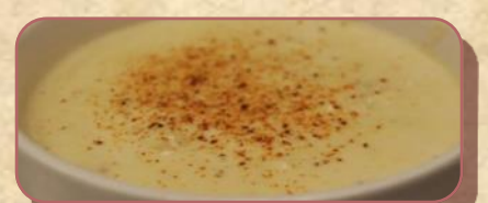
Cream of Crab Soup

$34.95 Small / $54.95 Large Tomato, fresh mozzarella, basil & balsamic vinaigrette