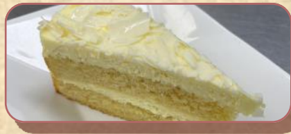
Limoncello Cake $4.95 per piece