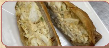
Chesapeake Eggrolls $3.75 per piece