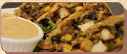
Southwest Egg Rolls $2.25 per piece