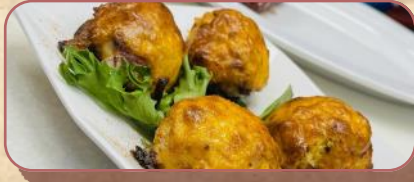
Stuffed Mushroom Imperial $6.25 per piece