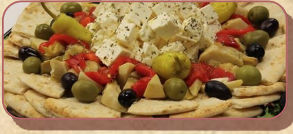
Mediterranean Delight Platter $39.95 Small / $69.95 Large

Small tray—10 to 15 servings / Large tray—20 to 25 servings