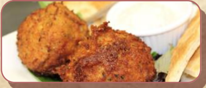
Falafel Balls $2.50 per piece (1.5 oz)