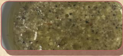
"Greek" House Vinaigrette

Homemade Dressings—$4.95 per pint / $9.95 per quart