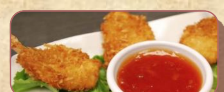
Coconut Shrimp $1.50 per piece