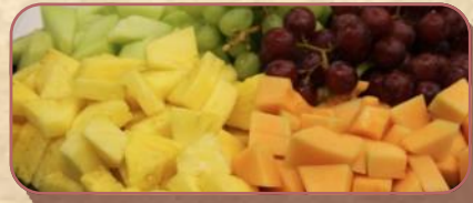
Fresh Fruit Platter $39.95 Small / $59.95 Large

Variety of cheeses (Cheddar, Provolone & Swiss) with grapes, crackers & spicy mustard dip.