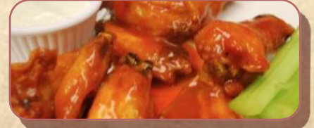
Wings Buffalo, Old Bay, Honey Old Bay, BBQ, Naked, Lemon Pepper, Cajun, Teriyaki, & Thai Chili $1.25 per piece