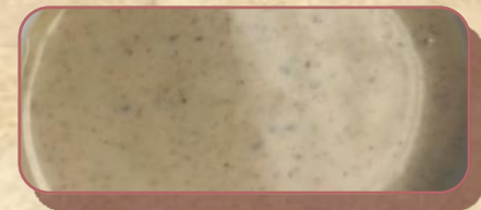
Old Bay Ranch