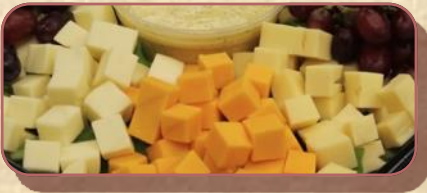
Cheese Platter $39.95 Small / $69.95 Large

Broccoli, cucumbers, carrots, celery and bell peppers. Served with Ranch dipping sauce.