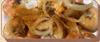
Steamed Shrimp with onions $20.99 Per lb.