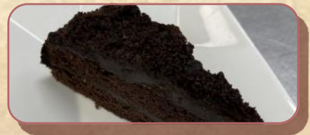
Chocolate Cake $4.95 per piece